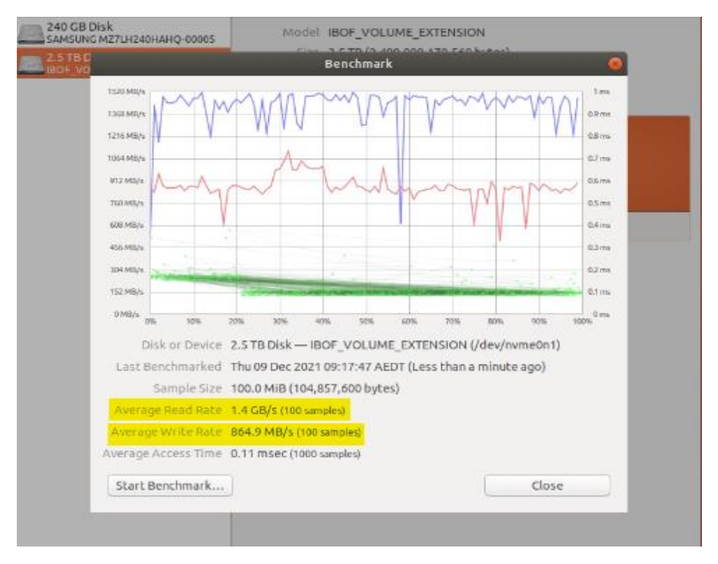
Figure 5 Disks Benchmark

The baseline UBUNTU Disks benchmarking is performed with the client connected to the block storage of block size 2.5TB and the average read rate was about 1.4 GB/s and average write rate was about 865 MB/s through a network of bandwidth 5 GB/s.