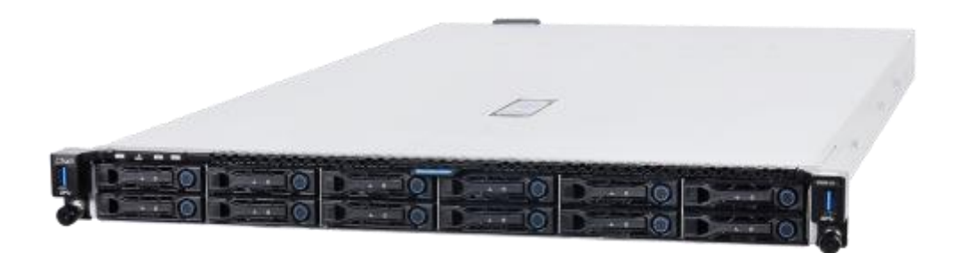
Figure 2 High density fast storage NVMe server